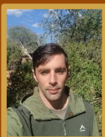
Donald Davis Pangolin Africa