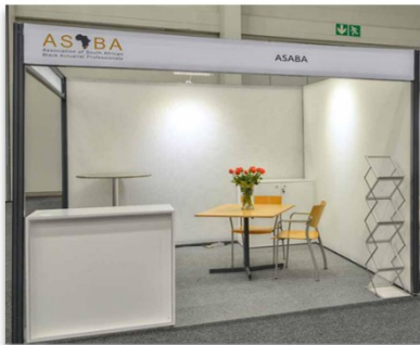
White Fabric 3x3m (corner)